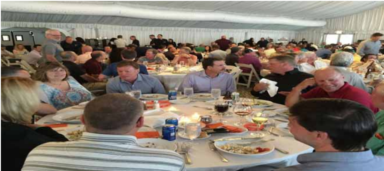
Annual Scholarship Golf Outing Banquet