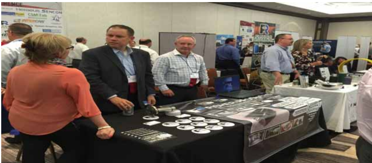
Some of the more than 70 Exhibitors during Wednesday's Sponsor hosted Event.