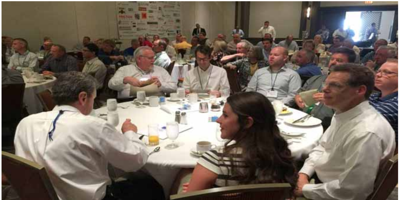
Annual Membership Breakfast