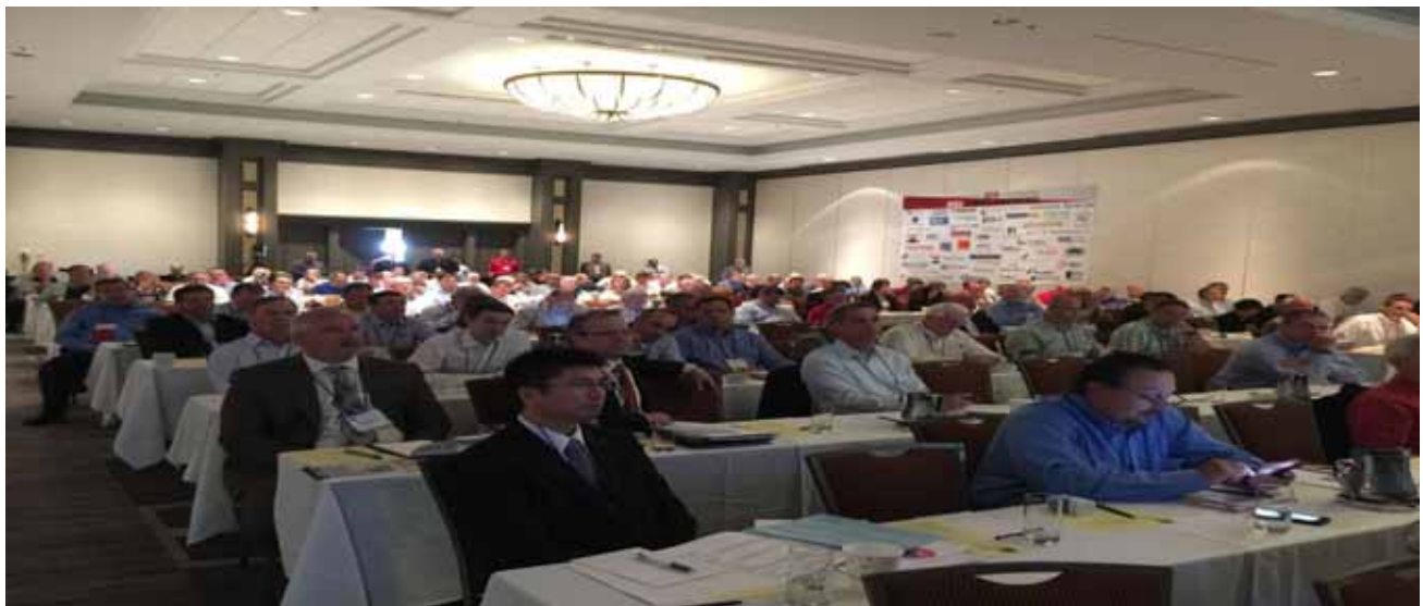
More than 300 enjoyed the Conference proceedings.